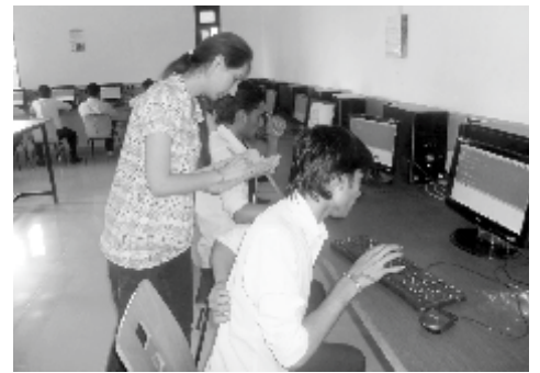
"Programming in C"

It was a test for fill ups to check the grammar and tenses of the students.